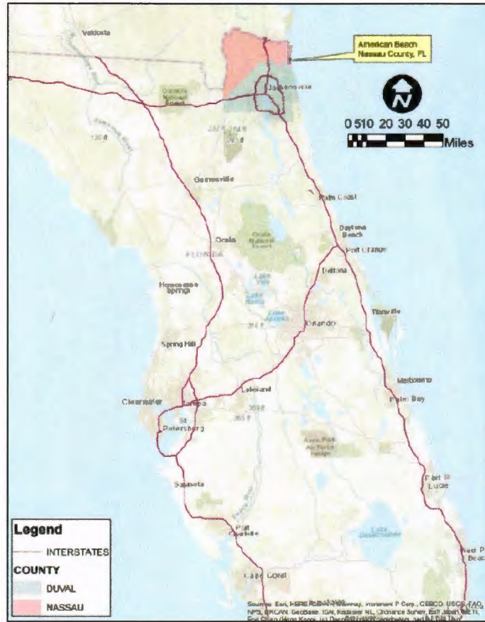
FIGURE 1: AMERICAN BEACH LOCATION MAP